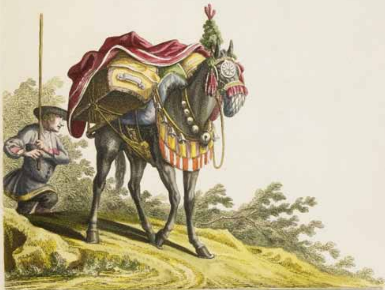
Maul-Bsel, beladenes Maulthier.