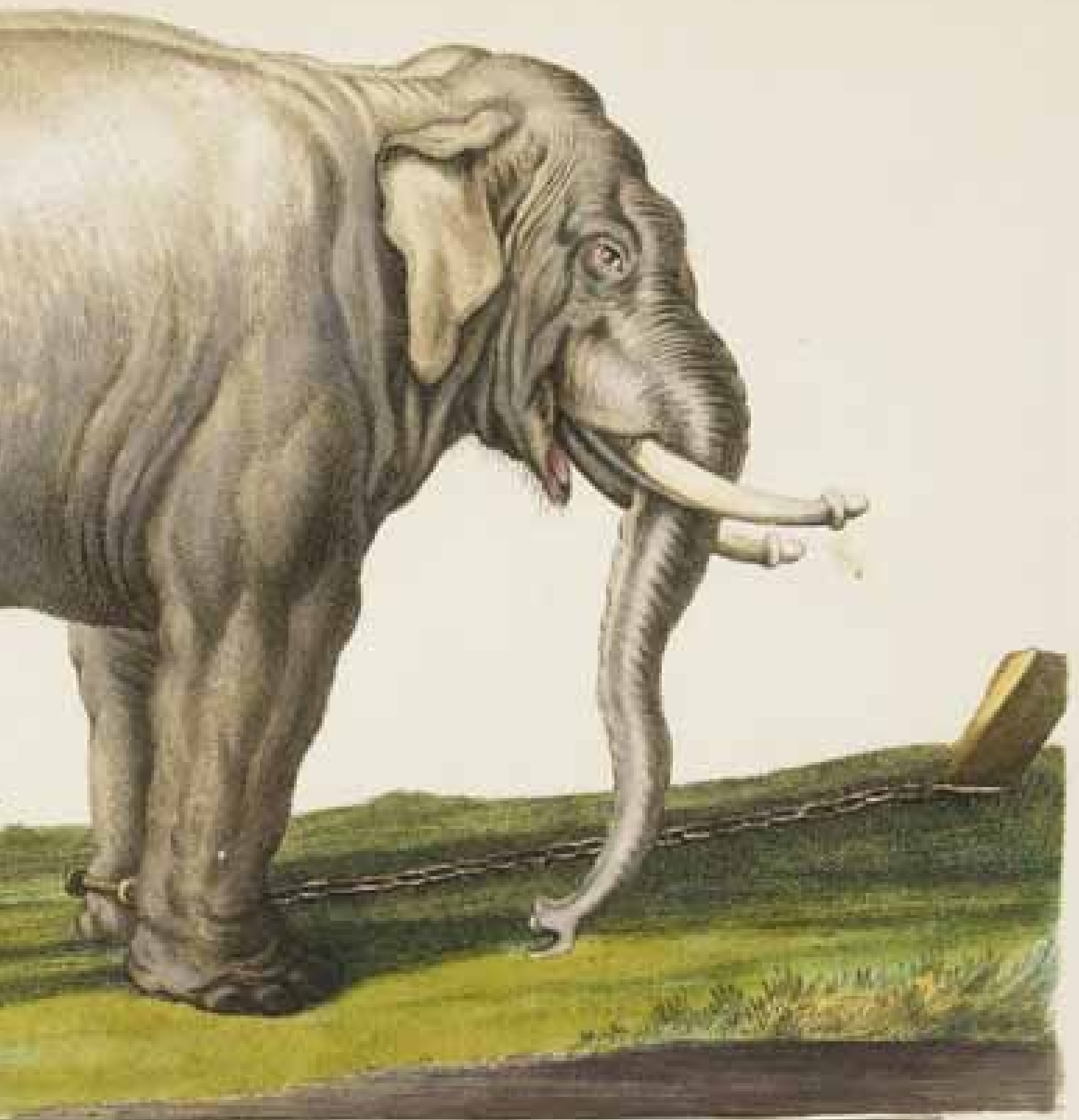
Ein Elefant. funf-Rufige.